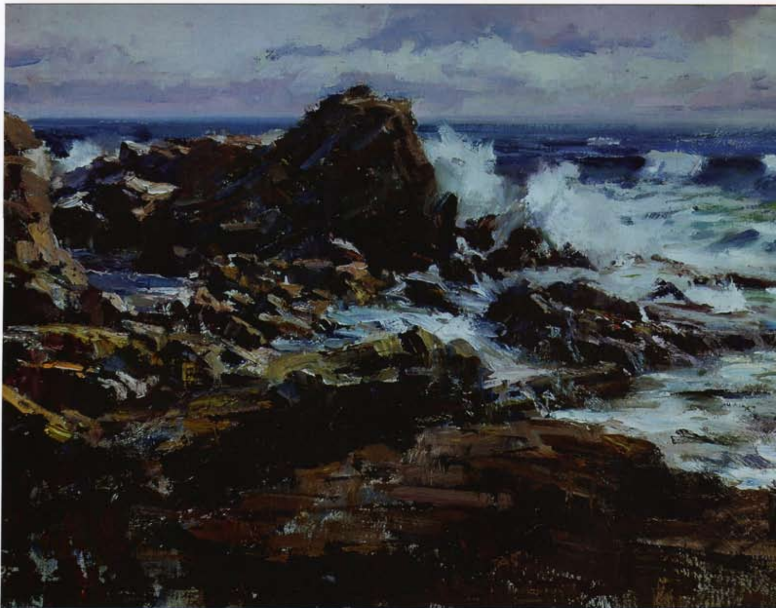
Rocky Shoreline, oil, 18" by 24"

"This painting was done one afternoon in Laguna at a location called Moss Point. The ocean is one subject that will always entice painters. In the genre of plein air, it is one of the most difficult and humbling. I have always lived near the ocean and have the utmost respect for it. Trying to capture its subtlety, while maintaining integrity, is the goal."